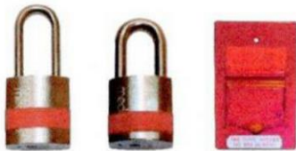
MPL-1 MPL-2 MKS