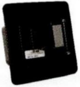
5000HR Recessed Mounted - Hinged Door

EAS Model 5000H (Hinged Door) SURFACE MOUNTED KEY BOX 10 Key capacity 4"H x 5"W x 3 1/4"D