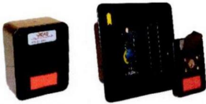
5000 Surface Mounted Lift Off Door 5000R Recessed Mounted Lift Off Door