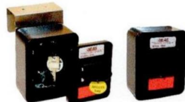
2500 DH Door Hung Mounted 2500 Surface Mounted