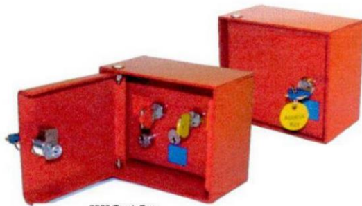
2800 Truck Box