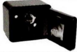
5000H Surface Mounted - Hinged Door